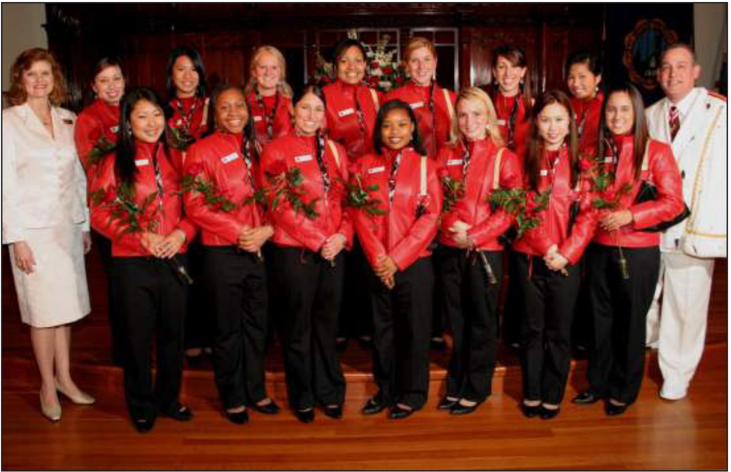
The 2005 Rose Festival Ambassadors were introduced to the public for the first time at the Blessing of the Festival, Sunday.