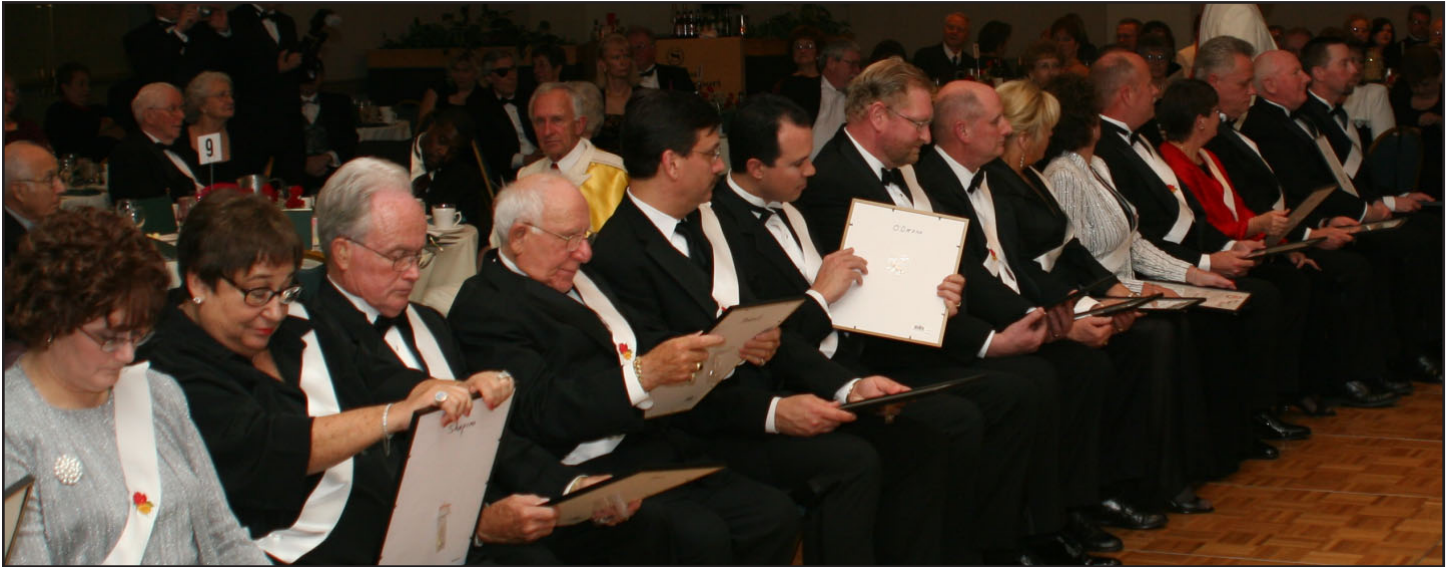
The Royal Rosarian Class of 2005 gather for a picture at the Knighting Ceremony at the Sheraton Portland Airport Hotel.