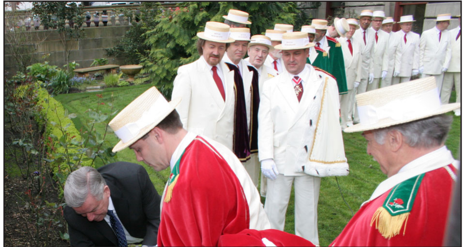
Rosarians planted a rose at Portland's City Hall to honor new Mayor Tom Potter.