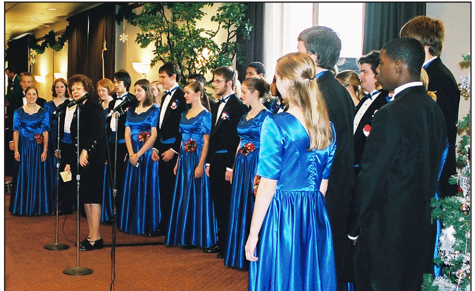
The Royal Blues, Grant High School's award-winning choral group, provided entertainment for this year's Annual Holiday Brunch at the Multnomah Athletic Club.